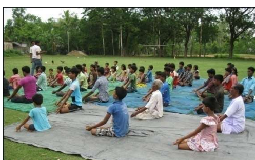
Yoga camp in remote villages of West Bengal