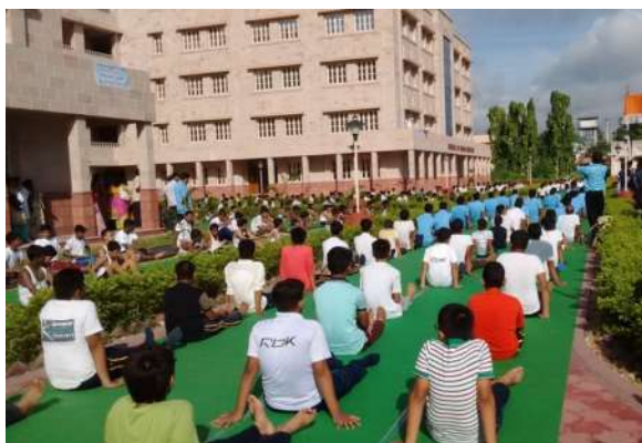
International Yoga day celebration in the University campus.